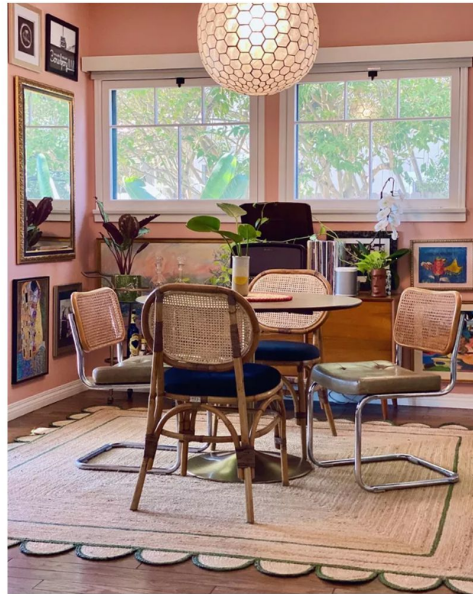
K Shan Design

Turn every wall into a gallery wall to create a warm boho-style dining room. This space from K Shan Design includes framed art that extends to the bottom half of the walls for an immersive and nonchalant feel. Vintage seating and a scalloped jute rug enhance the relaxed boho-style look.