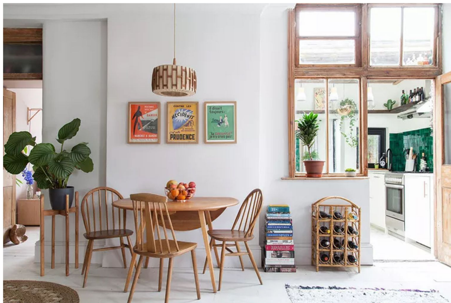
Design by Emilie Fournet Interiors

Adding vintage decor and furniture can add a boho-style feel to modern spaces. Emilie Fournet Interiors paired a Danish modern table and chairs with a midcentury modern pendant light and added decor touches like a trio of framed vintage prints and a rattan wine rack to this London dining room that gives the casual space a boho-style feel.