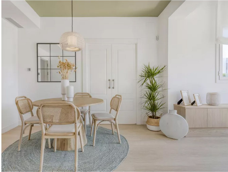
Mary Patton Design

Create a modern boho-style feel by sticking to a light palette and minimalist decor. This Scandinavian apartment dining corner from Fantastic Frank mixes pale wood tones with soft shades of blue and green for a soothing and understated feel. A simple vase of preserved flowers adds warmth.