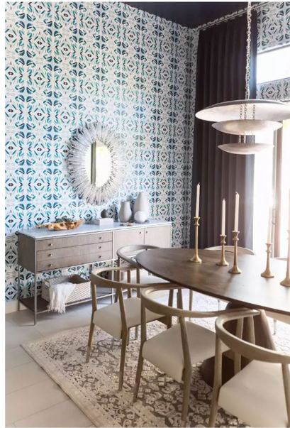
Design by Living with Lolo

Give a modern dining room a dose of boho design with colorful patterned wallpaper. This dining room from Living with Lolo mixes beige wood furniture with dynamic patterned walls in shades of blue and white. Dark paint on the ceiling and matching drapes add contrast.