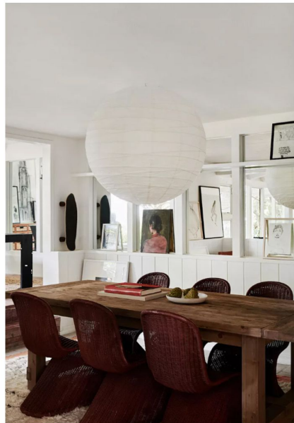
Marie Flanigan Interiors

Adding an oversized rice paper light above the dining room will add warmth and a sculptural element to a boho-style dining room that doesn't detract from other decor elements. Leanne Ford Interiors hung a large round pendant over the dark wood dining table and woven chairs of this white-walled dining room that has presence but a light profile, allowing art and objects to stand out.