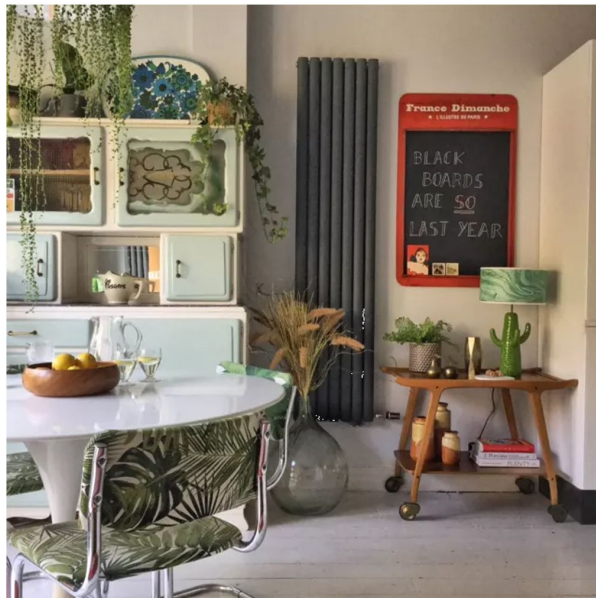
📷 Design by Emilie Fournet Interiors

Modern boho design often features midcentury pieces. This London dining room from Emilie Fournet Interiors is decorated with a mix of midcentury pieces from the table and pastel 1950s kitchen sideboard to the wooden bar cart. Leaf print upholstery on the chairs, plants, and a vase of dried grasses on the floor add casual nostalgic vibes.